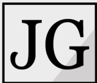
Jason Geer Photography

Jason Geer is a photographer located in north central Montana. He specializes in action and sports photography but also enjoys capturing breathtaking landscapes and wildlife photos. His ability to capture the dynamic energy and raw emotions of athletes in action is remarkable. Connect with Jason by following Jason Geer Photography on social media.